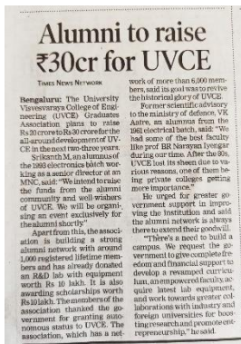
Times of India

We had invited Press Reporters from all the main newspapers (Kannada and English). On the day, we had News Representatives from Times of India, The Hindu, Prajavani, KannadaPrabha and the information was published the following day. Here are the glimpses from the Newspapers: